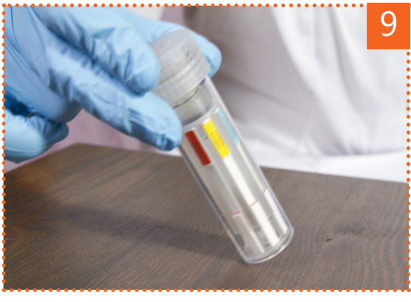
Sometimes, especially when the sample isn't homogenized, liquid migration can stop on one or more strips. In that case, tap the end of the strip tube on hard surface to allow migration to start again.