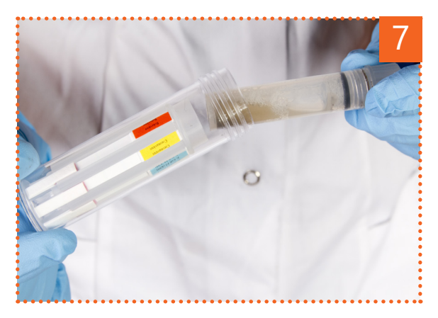
Insert the sample tube into the strip tube.