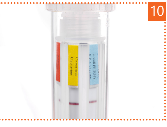
After 10 minutes, read the results using picture 11 as standard.