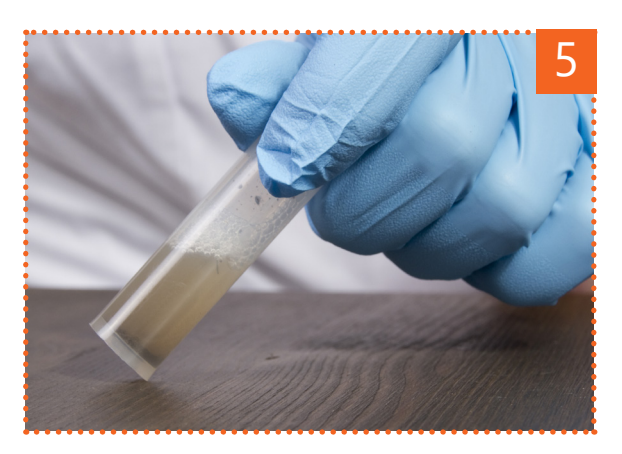
Tap the sample tube on a hard surface so that all the liquid is collected at the bottom of the tube.

Shake the sample tube to homogenize well.