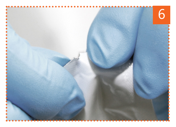
Tear the aluminium envelope open at the notch. Once the device has been taken out of the envelope its stability is of short duration, especially in a humid environment.